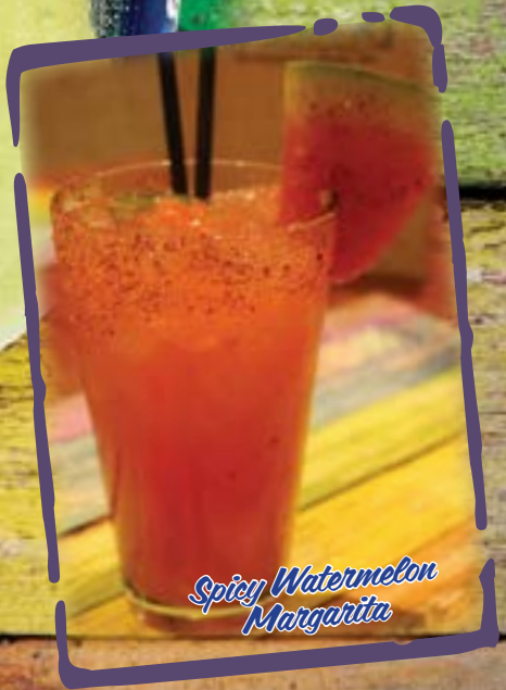
Spicy Watermelon Margarita