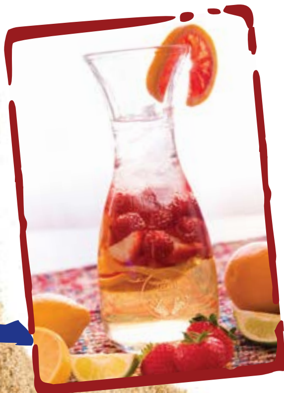
White Sangria Pitcher

White Eppa SupraFruta Organic Sangria topped off with Angry Orchard Rosé, served chilled with Assorted Fruits